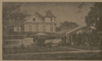
Hillier Funeral Home

BRYAN, TEXAS 502 West 26th St. PHONE TA 2-1572