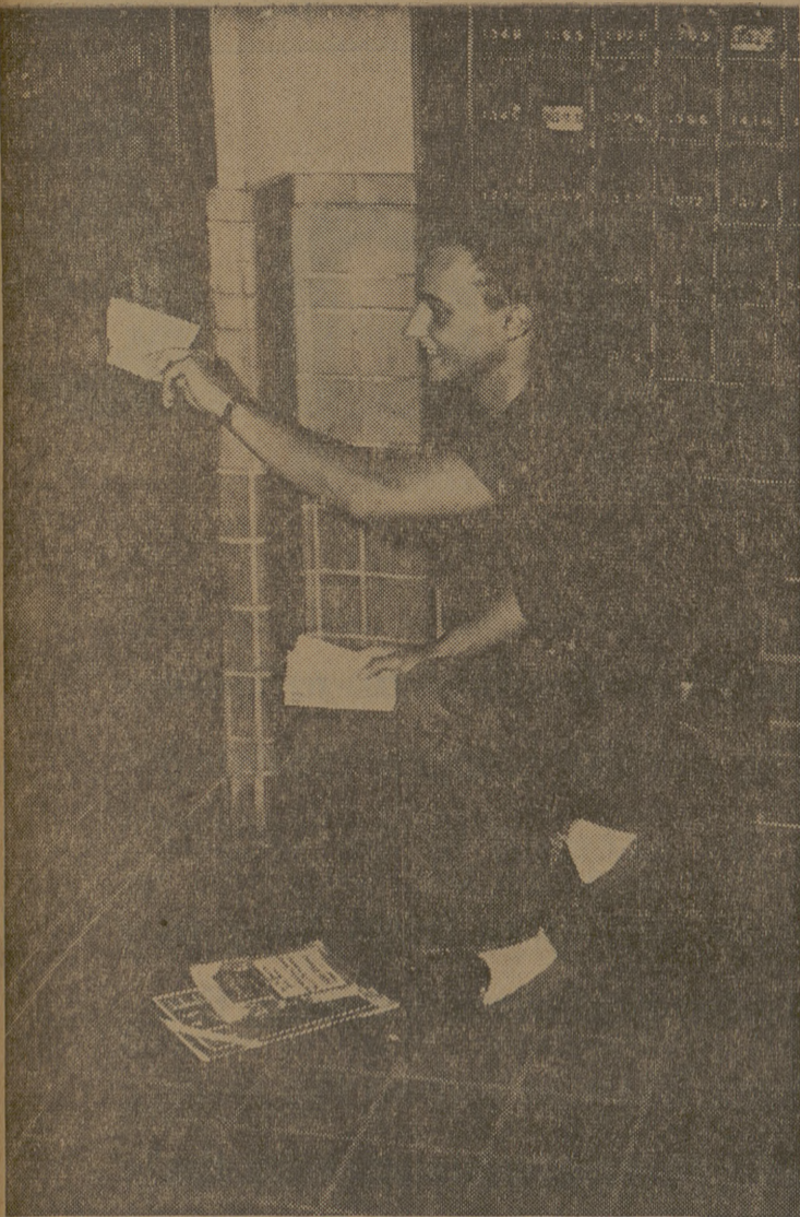
A Full Mailbox

After the new student has been at A&M a short while, he'll realize—as does this smiling Aggie—that a mailbox full of letters is one of the finer things in life.