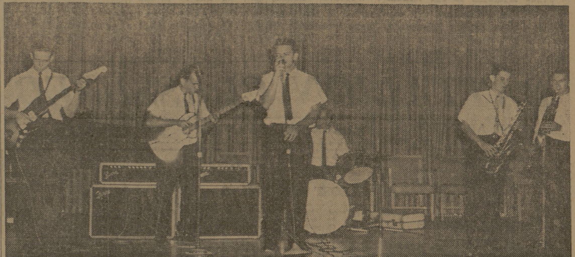
Citations Play At Monday Dance The regular MSC summer dance this week featured the Citations, a local recording group. Reports said the dance was one of the more successful one held this summer.