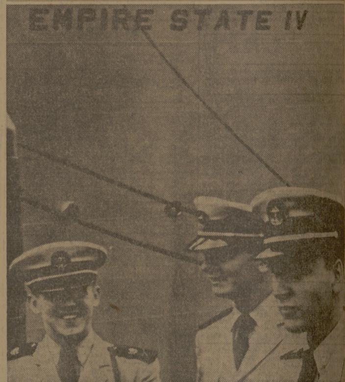
Aggies In Port

FINALLY, AFTER 14 days of smooth sailing, the ship entered the Irish Sea and proceeded to Dublin, where President Kennedy had stirred the Irishmen a few days before.