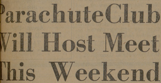
AGGIE JUMPER "UNPACKING" ... Ags host weekend meet at plantation