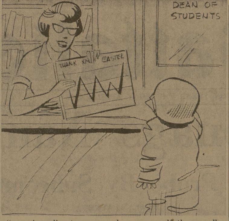
. . . According to our records, your grandfather usually becomes ill before holidays! We're sorry to hear he's feeling poorly again, but the dean can't excuse you from class before the Easter holidays."

But Ol' Windy could only grunt that he didn't know anything about the missing items, and couldn't care less. He was in a hurry to get to parking ticket appeals court, so he could have his chuckles for the day.