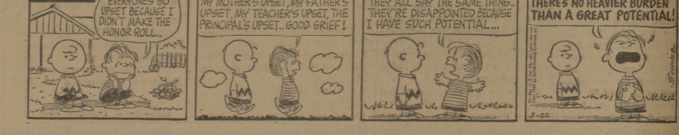
By Charles M. Schulz