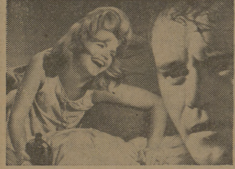
Jack Lemmon and Lee Remick "Days of Wine and Roses"

This, in its own terrifying way, is a love story!