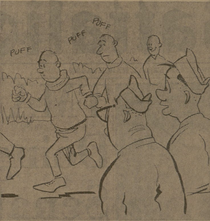
"Th' civilian weekend has always been a big event, but this is th' first time they've ever gone into training for it!"