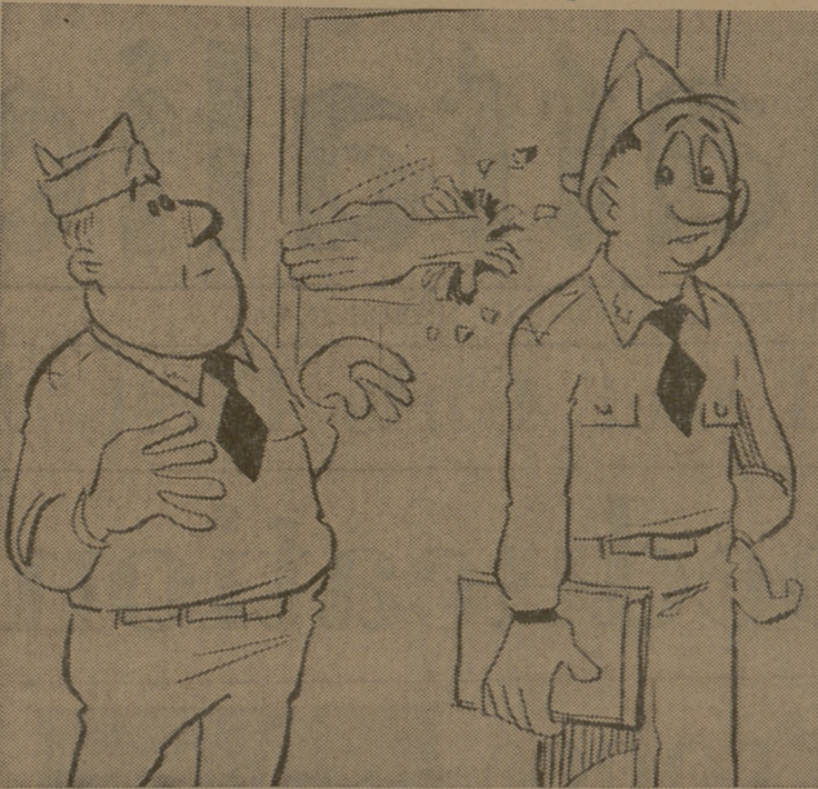
"... I'll be glad when this karate craze is over!"