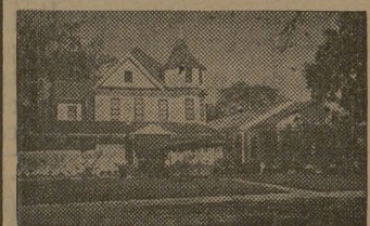
Hillier Funeral Home

BRYAN, TEXAS 502 West 26th St. PHONE TA 2-1572