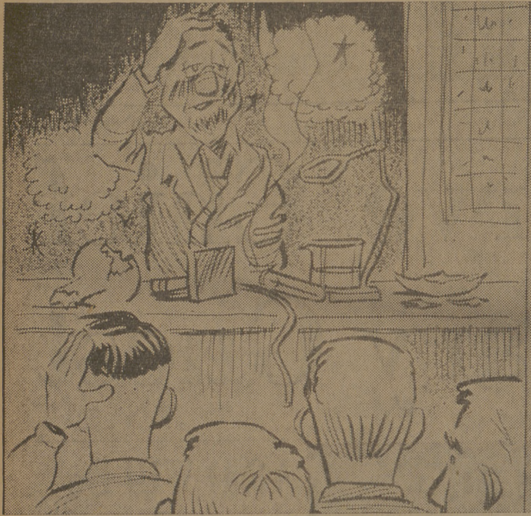
"... There's no need to carry this experiment further—the principle involved is apparent..."