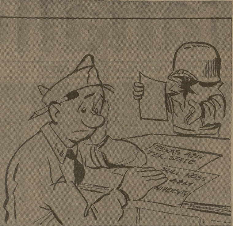
"... How does this one sound—Texas Gladitorial College?"