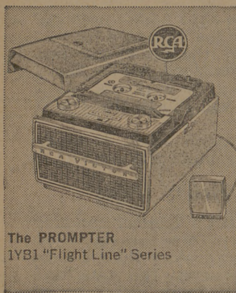
The PROMPTER 1YB1 "Flight Line" Series