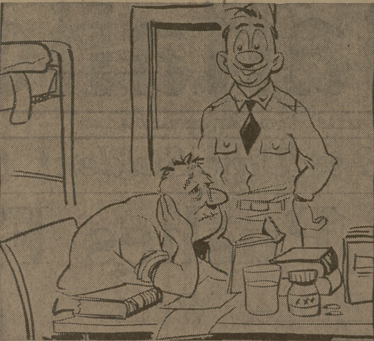
"... You seem to have made a splendid adjustment to dead week!"