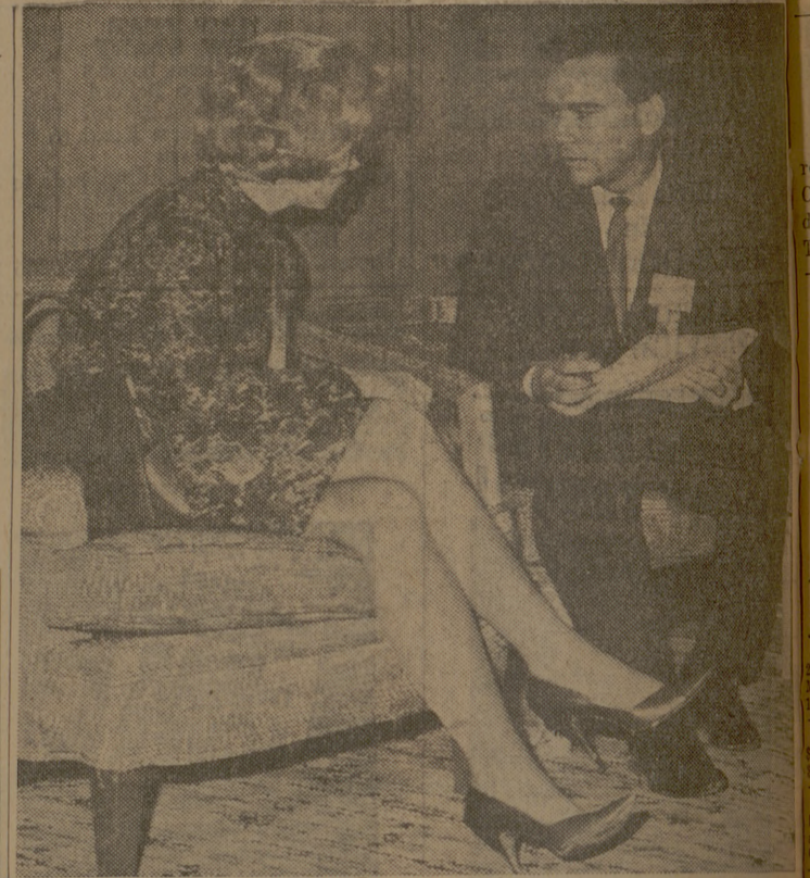
Talking Things Over

Representatives of groups wanting to help needy families pick names from a list supplied by qualified authorities, or they may find a needy family themselves. The 51 families on the list this year have from one to nine children.