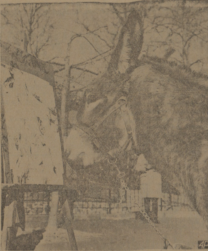
Not Bad For First Try

Marionette string-pullers were mentioned in the Hindu epic, "Mahabharata."