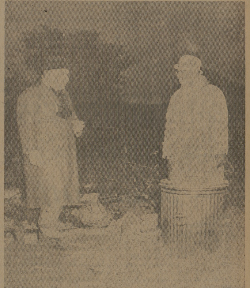
BONFIRE COFFEE POT ... helps guards keep watch