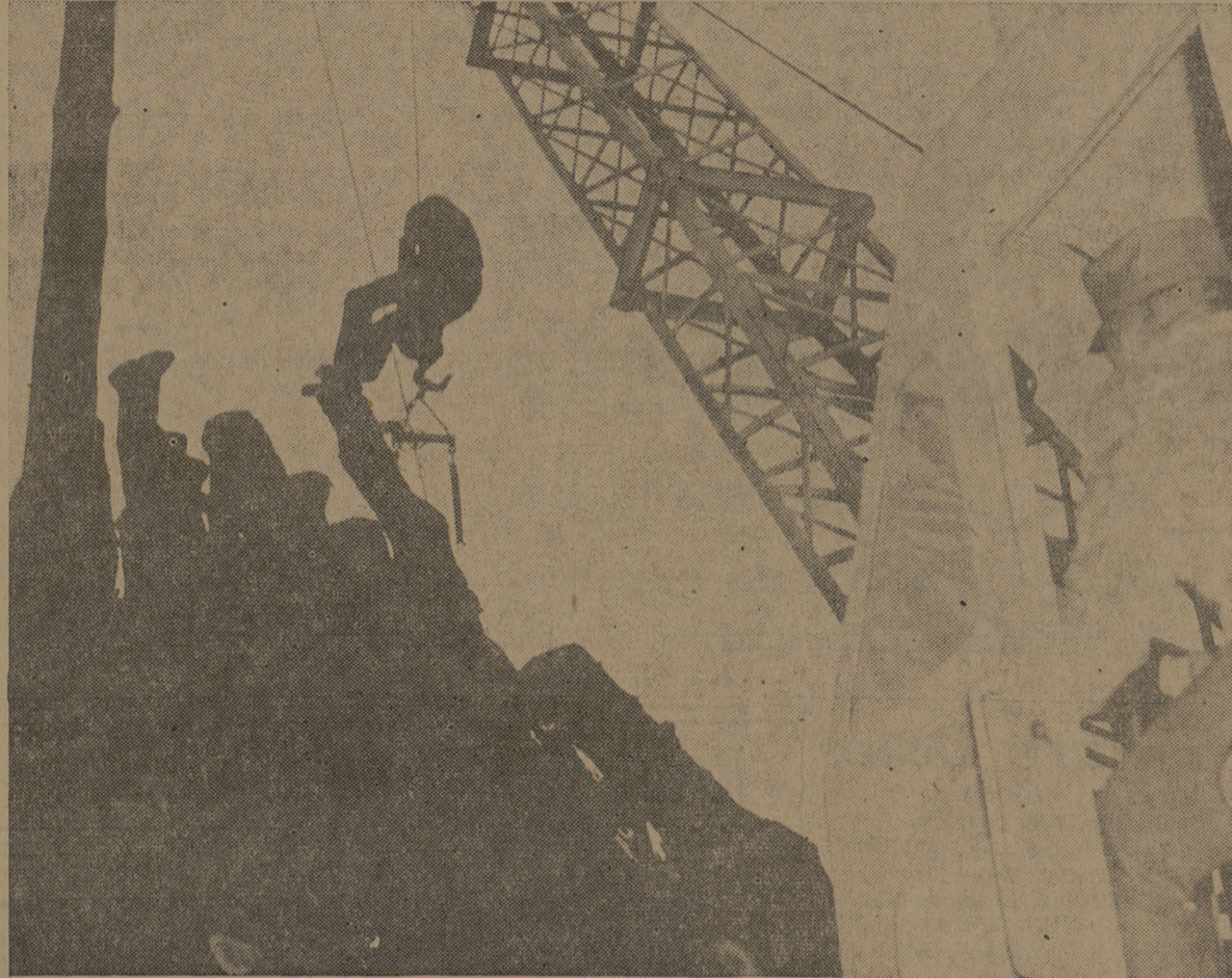
GOING UP ... crane hoists Ag to top of stack