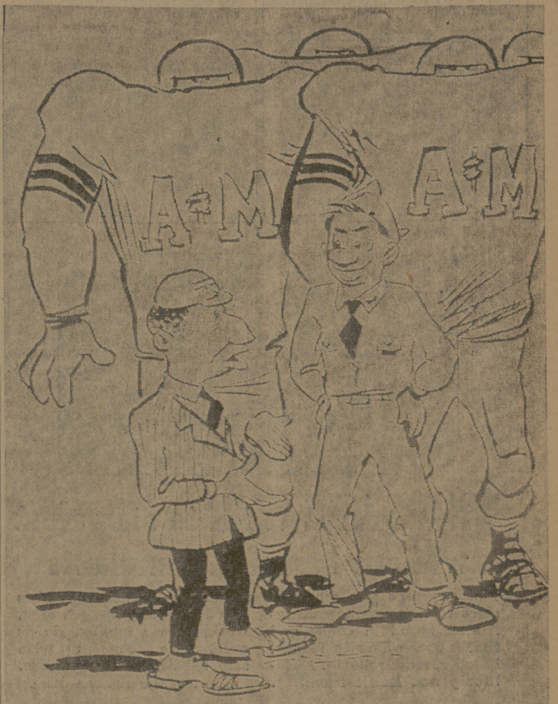
"... We're hoping that you fellas will cooperate so we can keep our No. 4 national rating! Think of the asset it would be to the conference!"

Applications will be taken from Nov. 26-29.