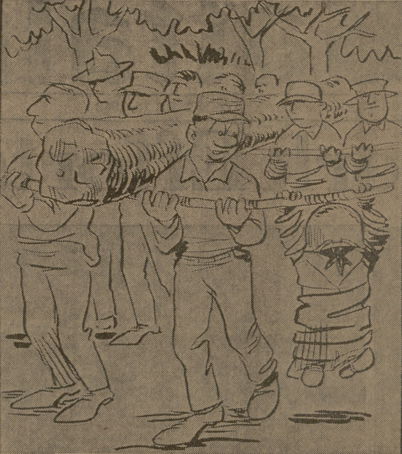
"... It's not that we don't appreciate your willingness . . . it's just that you might be better suited doing something else!"