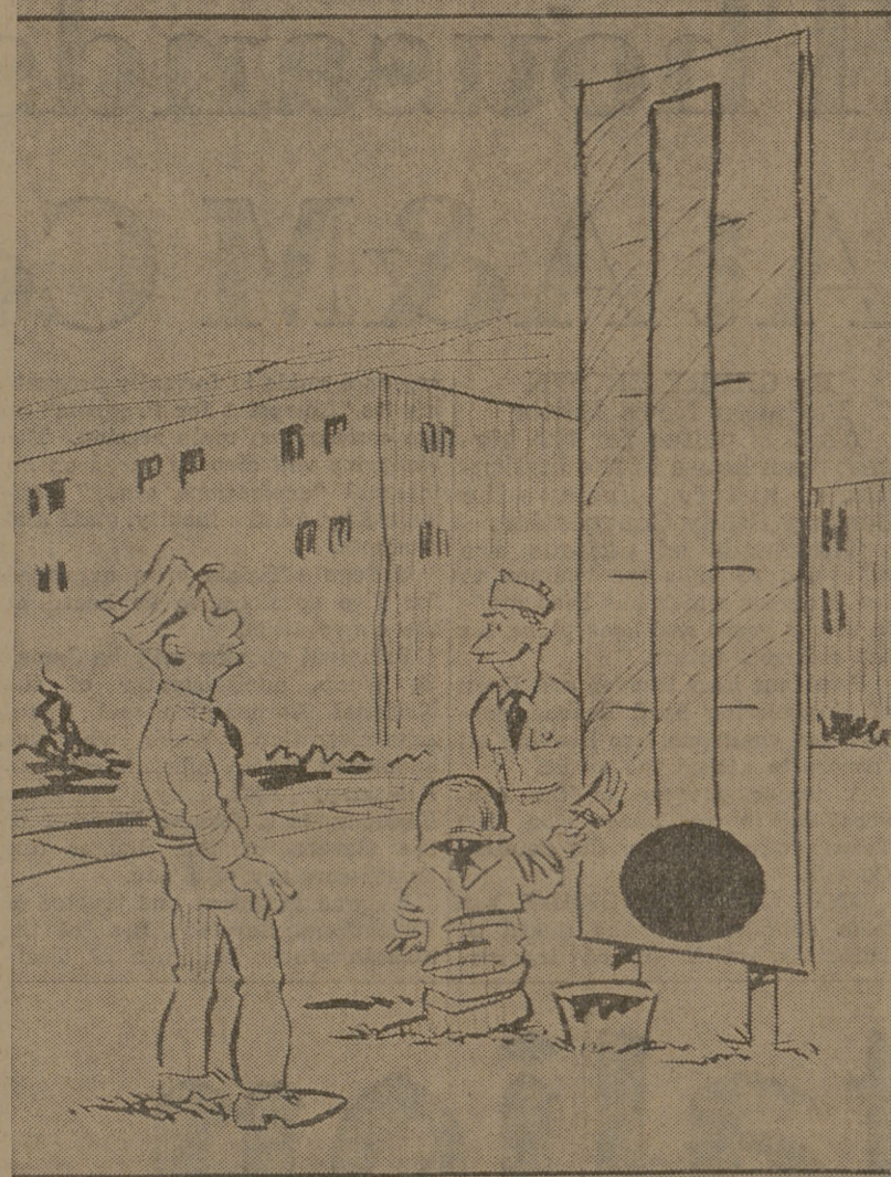
"... Naw! Not th' United Fund! It's to keep track of th' bonfire casualties."

We hope few students will choose to pass up the opportunity that will be theirs Friday. Every Aggie can make a tangible contribution to the operation and future of his school.