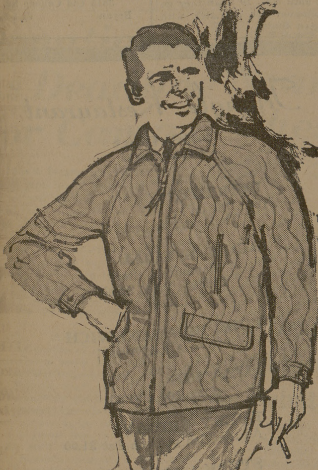
Ask for Ridge Stereo