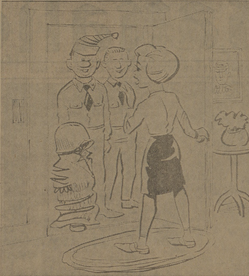
"... tricks or treats!"