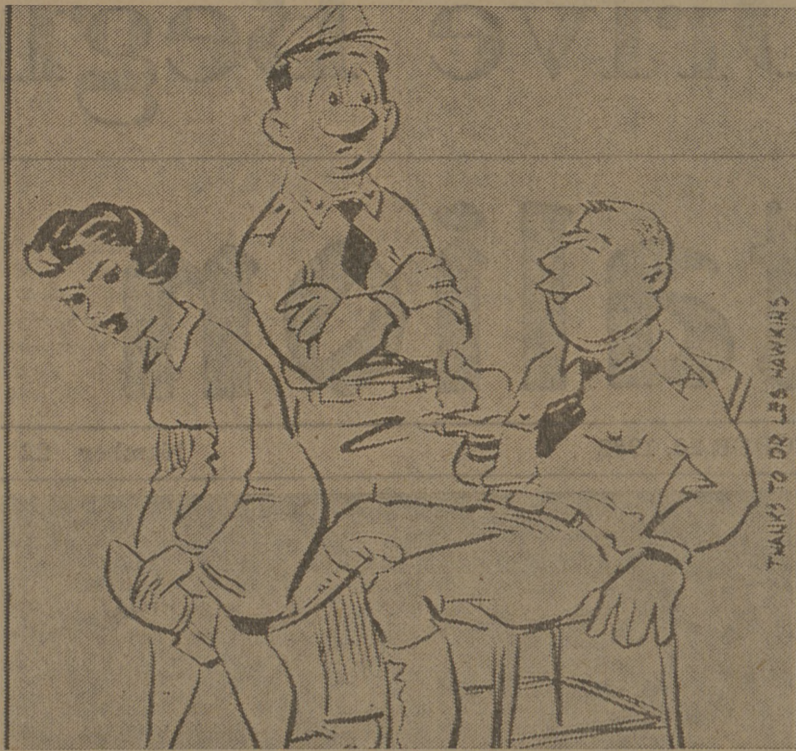
"... There are more advantages to being married during your senior year than any other!"