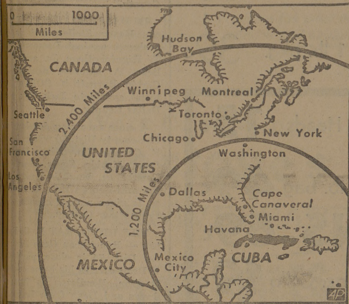
DEADLY CIRCLES ... show Cuban missile potential

In private, Latin Americans of the educated class concede that their countries look for strong leadership. It is, they say, part of the heritage of the "caudillo," the strong chief who commands respect rather than affection.