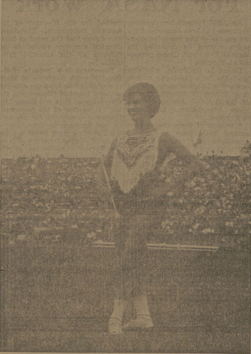
TCU TWIRLER AT HALFTIME ... big hit with Aggie section