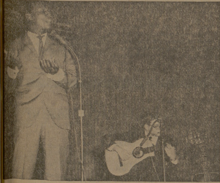
TOWN HALL STAR ... Leon Bibb belts out another song