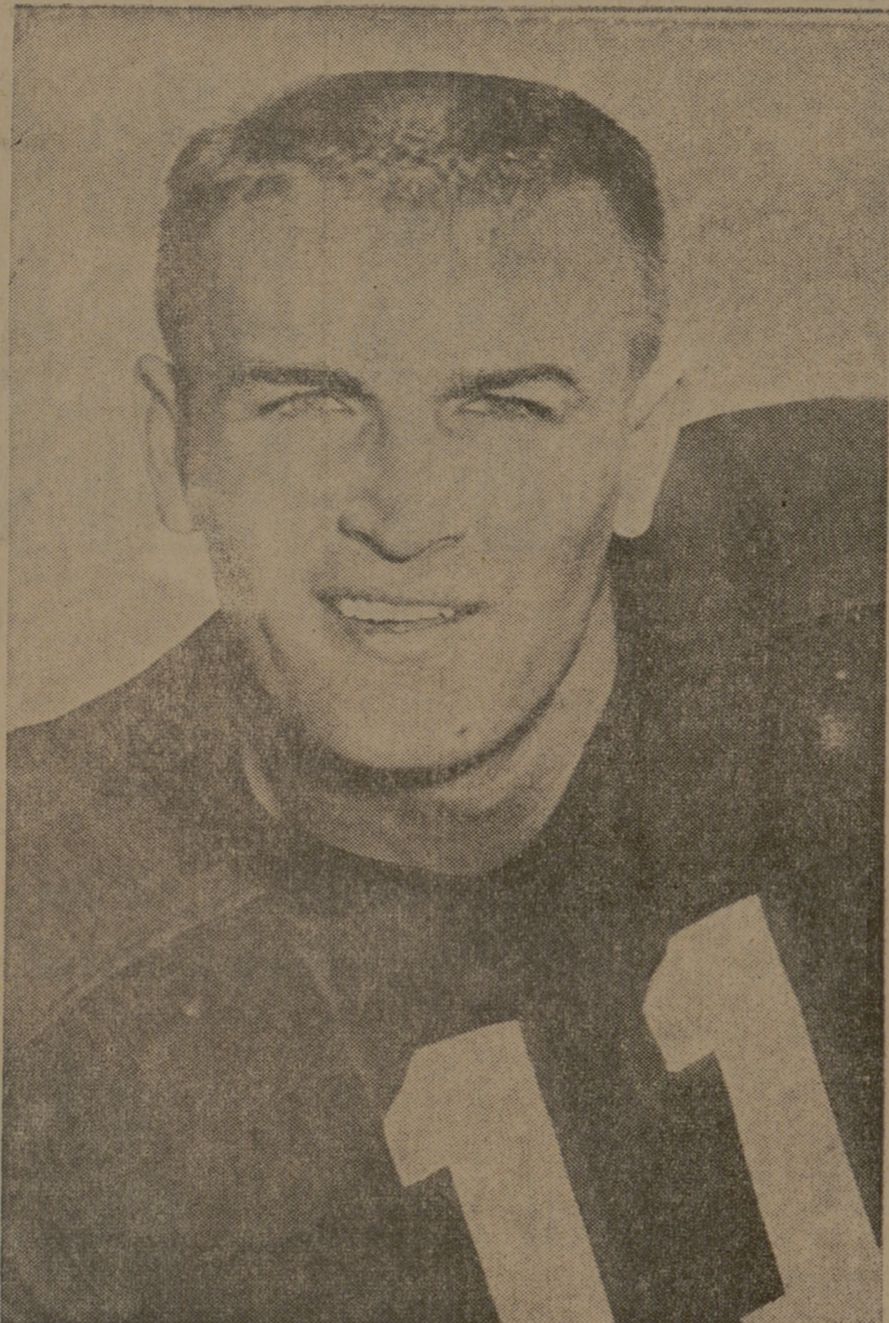
Leads Frog Attack