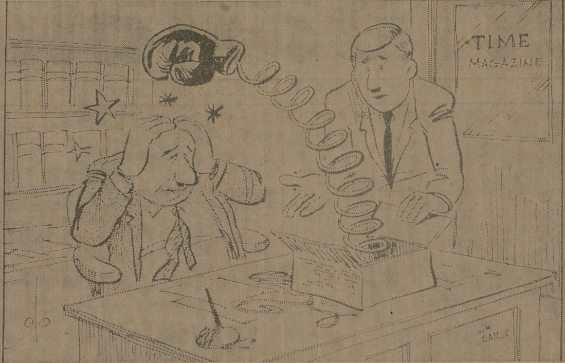
"... it's postmarked Texas A&M!"