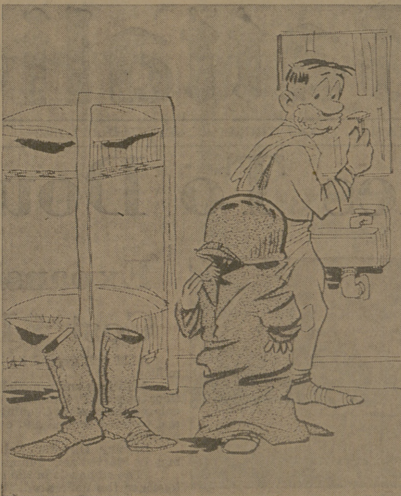
"... I can see right now that I'm gonna have problems when I'm a senior!"