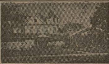
Millier Funeral Home

FIRST BAPTIST CHURCH 9:30 A.M.—Sunday School 10:45 A.M.—Morning Worship 6:10 P.M.—Training Union 7:20 P.M.—Evening Worship 7:15 P.M.—Wednesday Worship