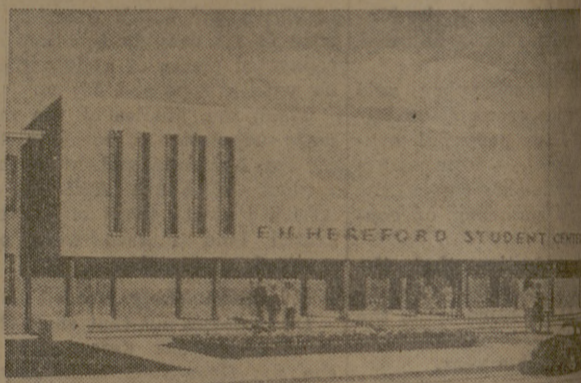
HEREFORD STUDENT CENTER... new Tarleton addition