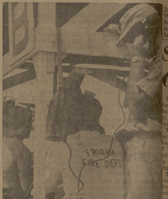
INSTRUCTOR RECEIVES INSTRUCTIONS ... two-way radio links headquarters, training

Many good things can be said for the course, but it is certainly realistic.