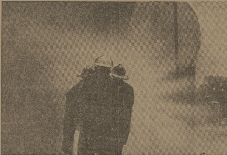
SMOKE EATERS' LAB ... trainees advance on oil fire