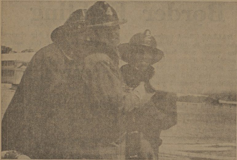
'BRING IT DOWN A LITTLE' ... instructor shows hose handling