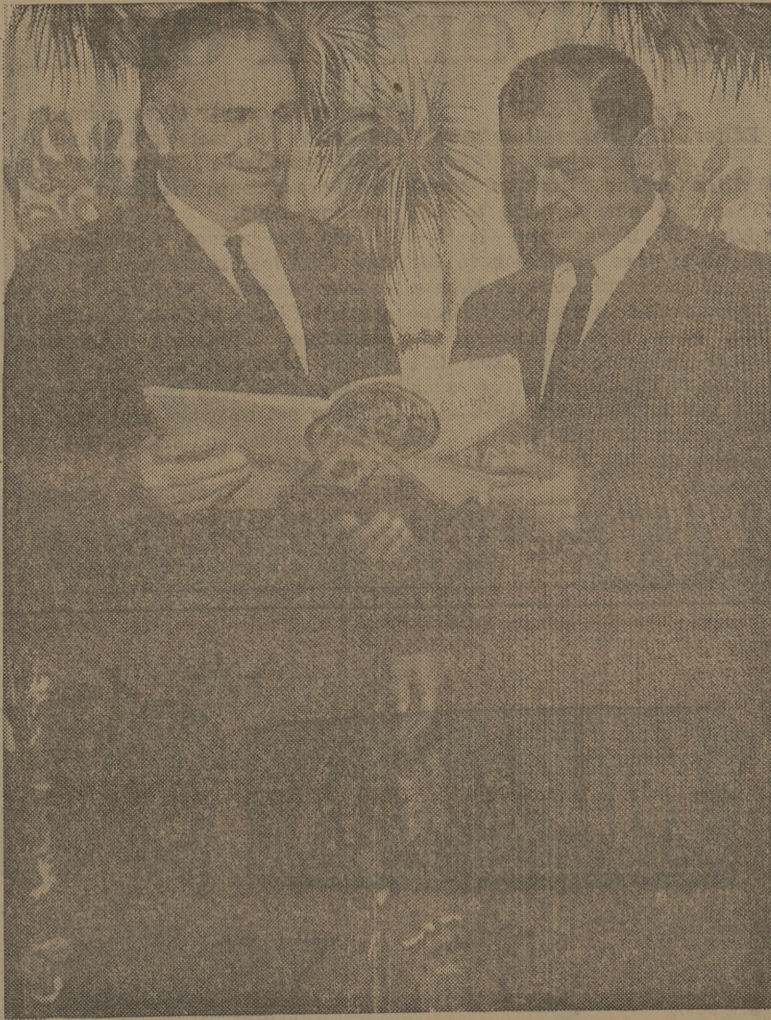
'Colonel and Barber' ... relive old times

Assessments against abutting property and the owners shall be the personal liability of the owners of such property and a first and prior lien on the property against which assessments are levied, and shall be due and payable on or before thirty days after date of completion and acceptance of the improvements and said assessments shall bear interest from date of such completion and acceptance until paid at the rate of eight per centum (8%) per annum, payable annually, provided, any owner shall have the right to pay the assessment at any time before maturity by paying principal and interest accrued to date of payment, provided further that if default be made in the payment