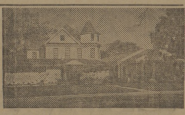
Hillier Funeral Home

FAITH CHURCH UNITED CHURCH OF CHRIST 9:15 A.M.—Sunday School 10:30 A.M.—Morning Worship 7:30 P.M.—Evening Service COLLEGE HEIGHTS ASSEMBLY OF GOD 9:45 A.M.—Sunday School 11:00 A.M.—Morning Worship 6:30 P.M.—Young People's Service 7:30 P.M.—Evening Worship A&M METHODIST CHURCH 9:45 A.M.—Sunday School 10:55 A.M.—Morning Worship 6:30 & 8:00 P.M.—HYF Meetings 7:00 P.M.—Evening Worship OUR SAVIOUR'S LUTHERAN CHURCH 8:15 & 10:45 A.M.—The Church at Worship 9:30 A.M.—Bible Classes For All Holy Communion—First Sunday Each Month A&M PRESBYTERIAN CHURCH 9:45 A.M.—Church School 11:00 A.M.—Morning Worship FIRST BAPTIST CHURCH 9:40 A.M.—Church School 11:00 A.M.—Worship 6:15 P.M.—Training Union 7:15 P.M.—Worship