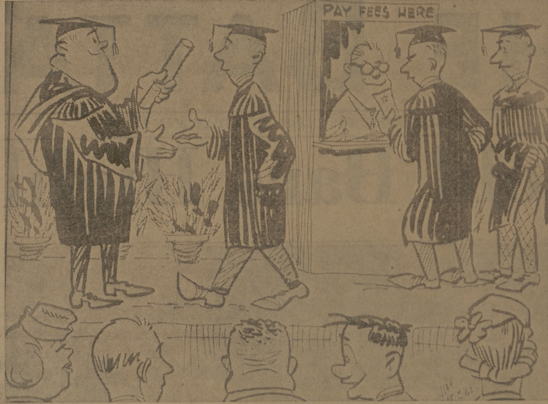
"... I notice they're making sure all lab fees are paid this year!"