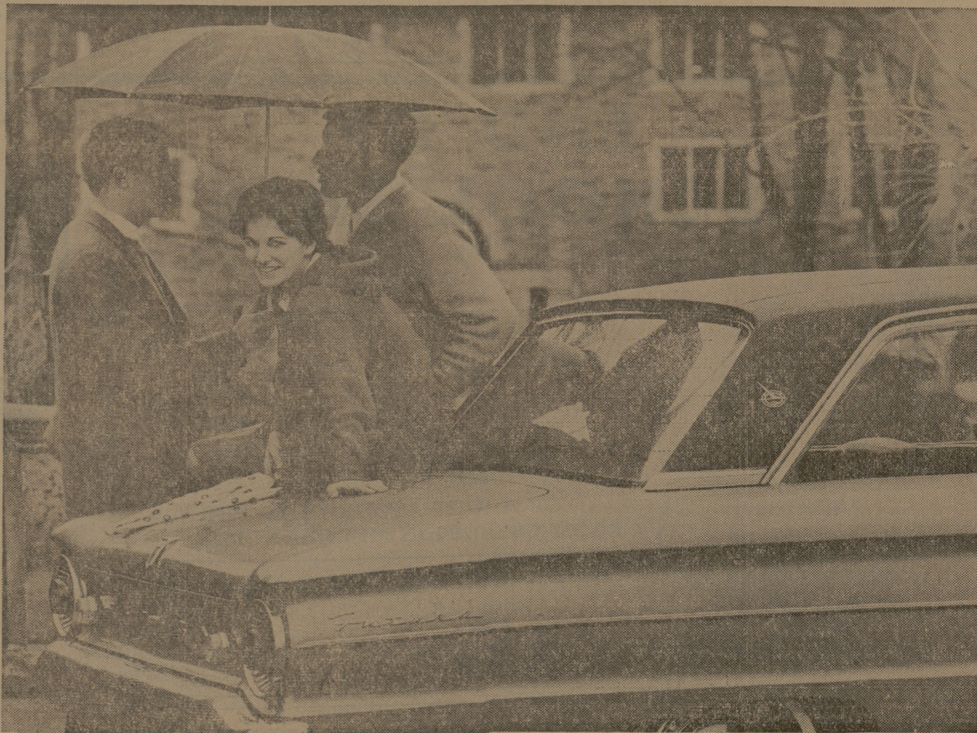
This green-eyed Lively One is a Classics Major from Cranford, New Jersey