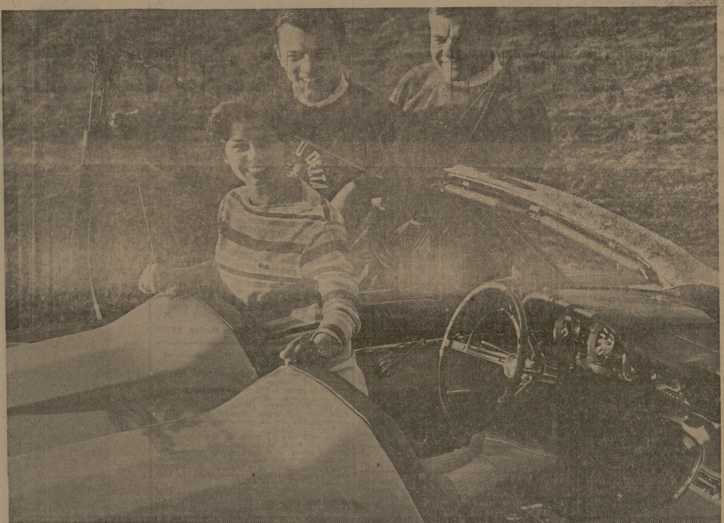
This lively Homecoming Queen hails from Chardon, Ohio, and will be a June bride this year.