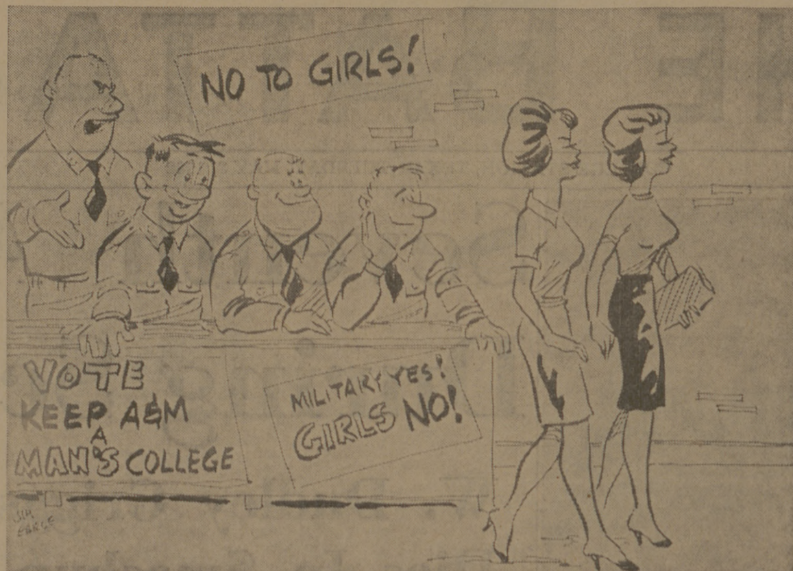
"... remember men, our cause is bigger than each of us! We must put all of our effort into our campaign... right men? ... men... men?"

3. Would attract more grants for research from industry, government and foundations.