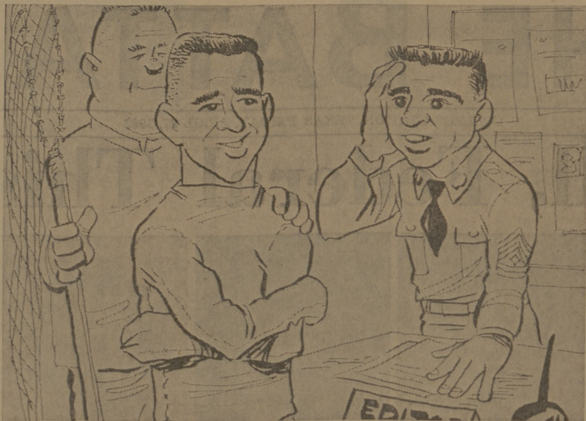
"... congratulations, but under the circumstances I won't shake hands! If I can be of help to you stop by on visiting days!"