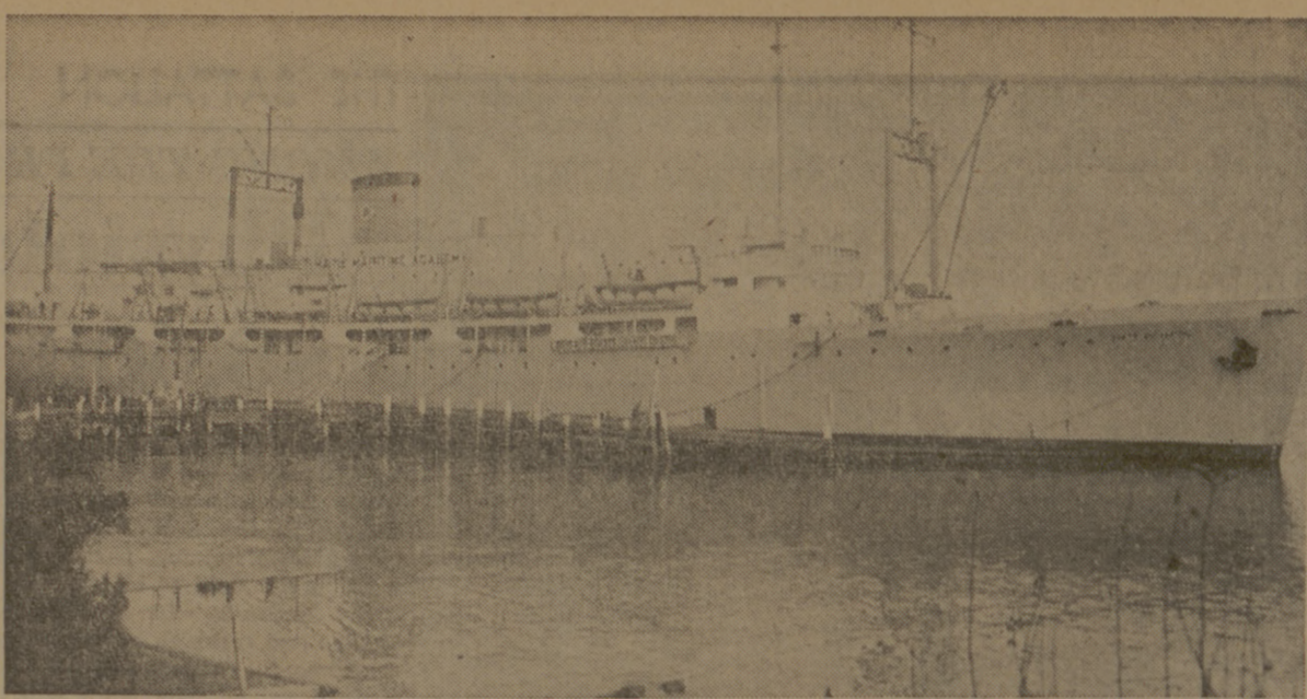
TMA Training Ship

Dodson also went through a shipping warehouse while in the Crescent City to select instruments and equipment to be used in the TMA's nautical and engineering labs. Included were sextants, gyroscopes and drafting equipment.