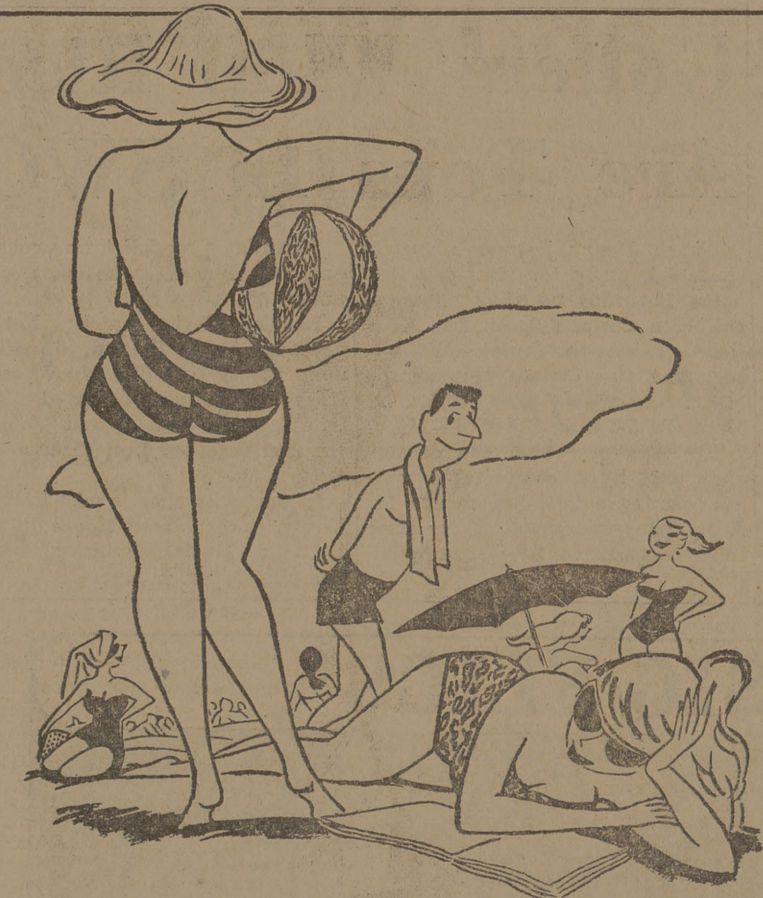
The mover is more of a girl scout than a girl watcher.

Presented by Pall Mall Famous Cigarettes