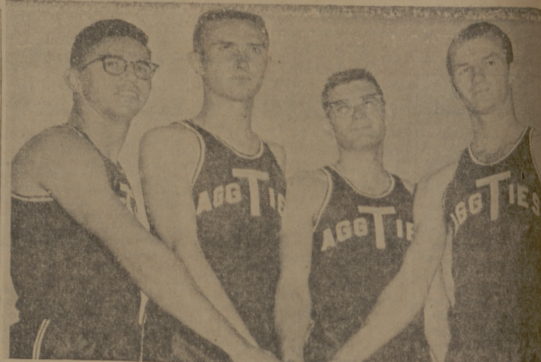
A&M's Unbeaten Sprint Medley Relay Team

In Class B softball played yesterday Sqd. 12 took a close one from Sqd. 5, 6-5. A-1 out-hit Sqd. 2, 14-10, and F-3 blasted the Maroon Band Fish, 12-3.