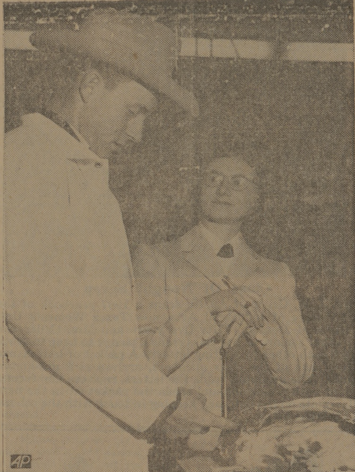
Lady Meat Judge