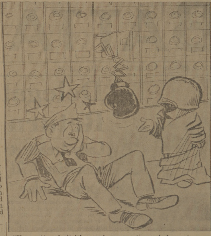
"You gotta admit it's a unique way to remind you to pay your box rent!