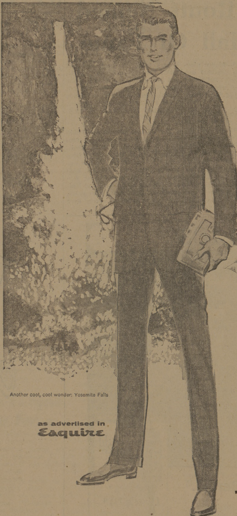
Another cool, cool wonder: Yosemite Falls