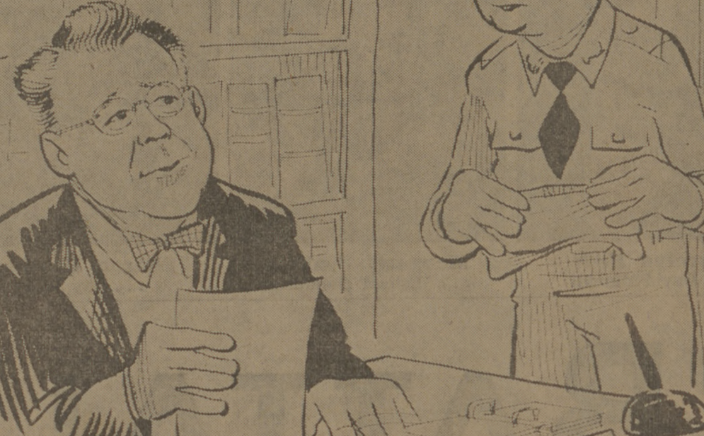
"You misunderstood, sir, when I said my grades were low due to illness! I haven't been in th' hospital-I'm just sick of studying!'

Sunday — Bible classes, 9:45 a.m.; Morning worship, "Overcoming Obstacles," 10:45 a.m.; Young people's classes, 6:15 p.m.; Aggie class, 6:30 p.m.; Evening service, "The Christian's Hope of Everlasting Life," 7:15 p.m.