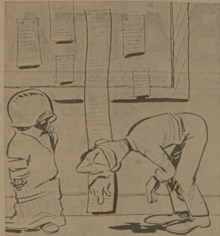
"I wish they'd post these grades alphabetically instead of in descending order!"