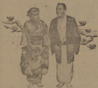
ROSALIND ALEC RUSSELL & GUINNESS A MAJORITY OF ONE