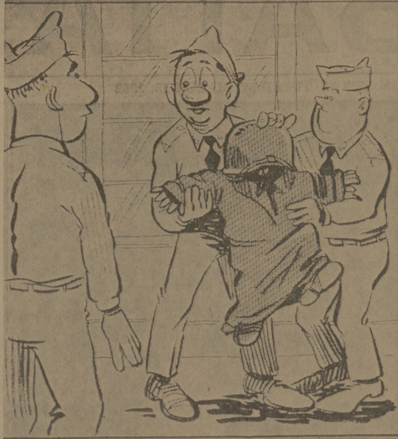
"... He goes through these withdrawal pains after every big weekend. He's addicted to girls!"