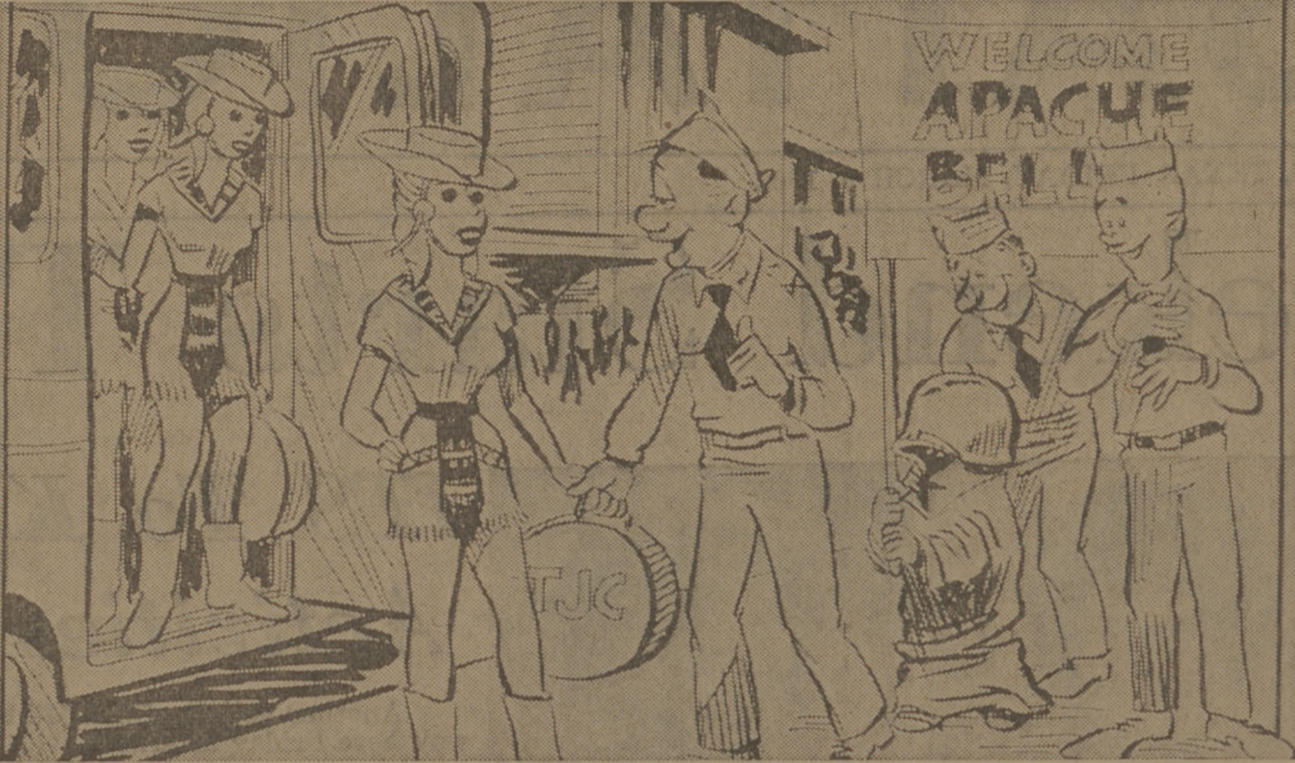
... Welcome to A&M! In order for your stay to be as pleasant as possible, our outfit has volunteered to serve as your host! We have made plans for every single minute of your visit ...!