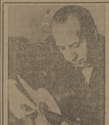
CARLOS MONTOYA A TOWN HALL PRESENTATION March 22 & 23