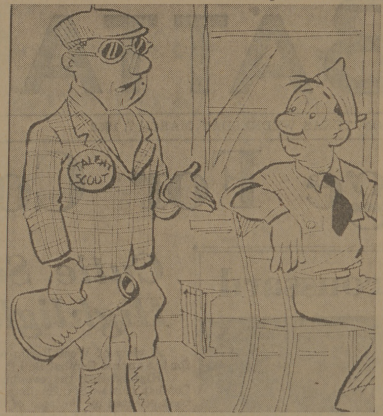
. . you know I'm not a Hollywood talent scout and I know I'm not a Hollywood talent scout, but think of all those babes in th' intercollegiate Talent Show Friday night