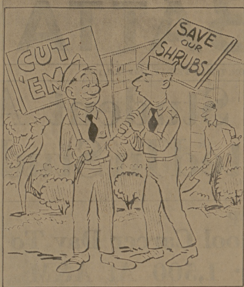
"... frankly, it doesn't matter to me—I just like crusades!"